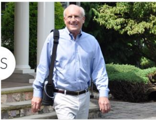
A portable oxygen concentrator is a lightweight alternative.